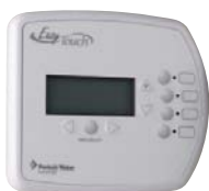
Indoor Control Panel (for 4 or 8 function control)

What's more, EasyTouch systems set the standard for operating simplicity with push-button operation and clear, intuitive instructions and displays. Your EasyTouch system includes all circuitry and fully programmable controls in a single Load Center installed near your pool or spa equipment. This avoids expensive wiring and installation costs to make EasyTouch affordable for any budget. For even greater convenience, you can add any of these optional controllers: