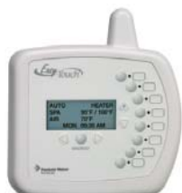
EasyTouch Wireless Controller