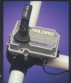
Automate any Jandy Valve with a JVA.

Pool and spa professionals have made Jandy the industry standard in valves. Jandy Industries is well on its way to selling three million valves for one reason—a reputation for quality.